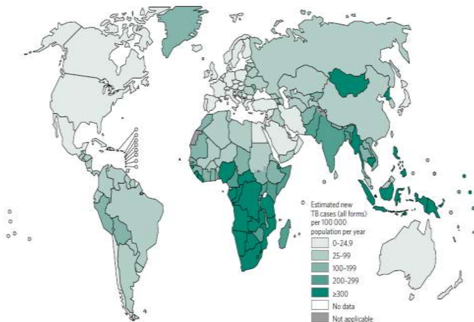
Figure 2: Estimate of TB incidences rates, 2015 (WHO, 2016)

The variation among countries was very obvious, ranging from more than 40 deaths per 100000 population in five Asian countries with high TB burden (Papua New Guinea, Bangladesh, Myanmar, the Democratic People's Republic of Korea and Cambodia) and in many of the WHO African Region countries to less than one TB mortality per 100000 population in many high-income countries (WHO, 2016).